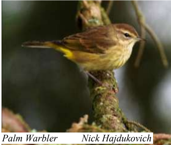
Palm Warbler Nick Hajdukovich

A very rare Palm Warbler was observed at the Airport Dike Trail November 4 – 8 (GV, PR, NH, AC, GB). A late-lingering Wilson's Warbler was observed at Indian Cove past the ferry terminal on November 6 (NH).