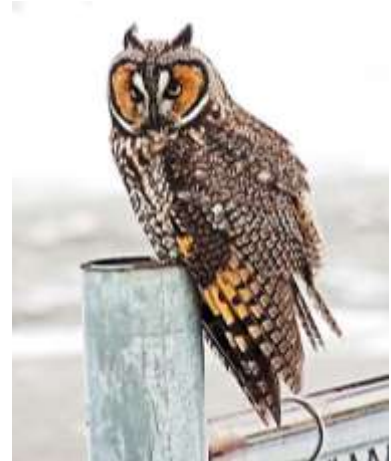
Long-Eared Owl