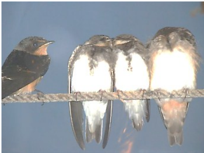
Mixed swallows at rest, from left: Adult Barn Swallow , two juvenile Bank Swallows and juvenile Cliff Swallow(????) .