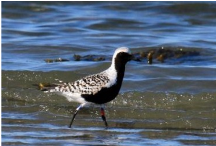
Banded Black-bellied Plover at the mouth of the Mendenhall River in Juneau April 28

Minus tides at mid-month didn't attract many shorebirds although I had some great close views