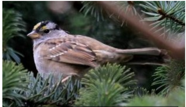
Hybrid White-crowned X Golden-crowned Sparrow

April is always an exciting time, as spring migration displays the wonder that it truly is. As the month progressed we witnessed the arrival of many old friends such as Trumpeter Swans, Greater Yellowlegs, Black-bellied Plovers, Tree Swallows, Yellow-rumped Warblers, and Golden-crowned Sparrows , just to name a few.