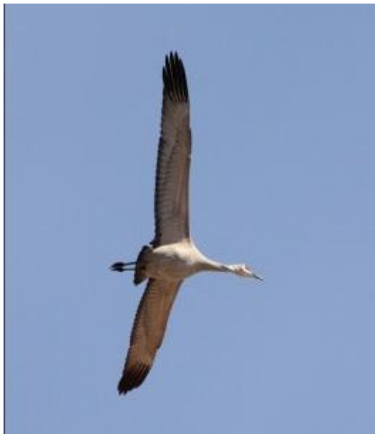
Sandhill Crane

view all the observations entered therein, as once again the most active birders in Juneau are putting their sightings in eBird. With that, here are a few highlights.