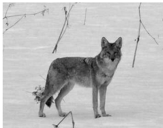
Coyote at Pt. Bridget on April 25