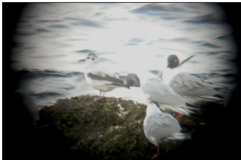
Figure 8. First-cycle Little Gull (left) with three adult Bonaparte's Gulls (right) at Ketchikan 10 April 2014. The smaller size of the bird compared to the Bonaparte's Gulls is difficult to judge in this photo, but note the extensive dark gray cap and blackish wing coverts that forms a large black bar across the wings—characters not shown by 1 st -cycle Bonaparte's Gull.

LITTLE GULL: A 1 st -cycle Little Gull at Ketchikan 10 April 2014 (SCH, AWP, JFK; Figure 8) provided the 3 rd local record. This species is a casual migrant and summer visitant to Alaska (Gibson et al. 2003), and there are about a dozen records for the state.