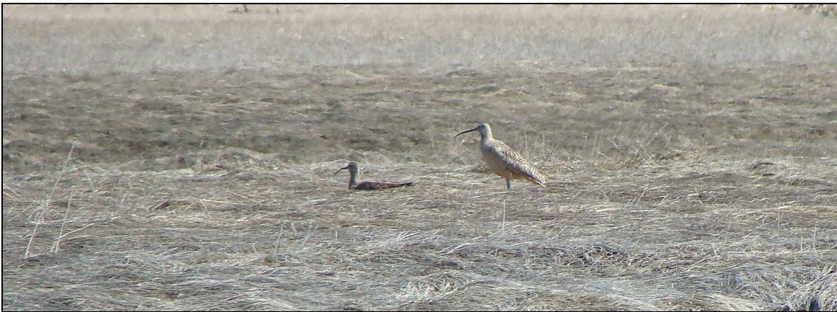
Figure 4. This photo of two curlews, a Whimbrel (sitting, left) and a Long-billed Curlew (standing, right) at Scout Camp, near Juneau, 3 May 2014, established the first documented record of the Long-billed Curlew in Alaska.

LONG-BILLED CURLEW: The birding highlight this spring was Alaska's first documented Long-billed Curlew near Juneau 3–7 May 2014 (MK, DS, m.obs.; Figures 4–5). The Long-billed Curlew breeds as close as central southern British Columbia where it is an early migrant, arriving late March–early April; non-breeding coastal migrants occur in southwestern British Columbia in May (Campbell et al. 1990b). There were only three prior sight reports for Alaska, likely also nonbreeding spring overshoots: one, 5–6 June 1973, Juneau, Eagle River beach, W. P. Dunn; one, 4 May 1992, Sergief Island, Stikine River flats, P. J. Walsh ( American Birds 46:464); and one, 30 May 2008, Yakutat, lower Situk River, J. DeWitt ( North American Birds 62:464).