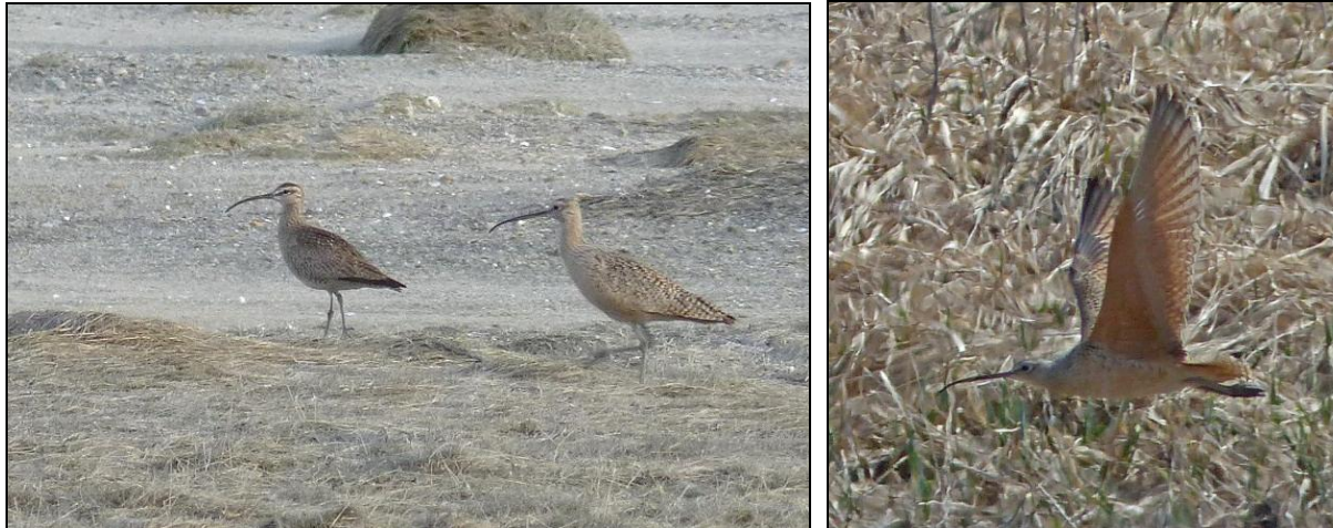
Figure 5. Additional photos of the Long-billed Curlew near Juneau 5–6 May 2014. In the left photo, note the larger size, longer bill, buffier plumage, and lack of bold head stripes on the Long-billed Curlew, on the right compared to the Whimbrel on the left. In flight, the Long-billed Curlew’s cinnamon underwings are distinctive and unmistakable as shown in the photo on the right.