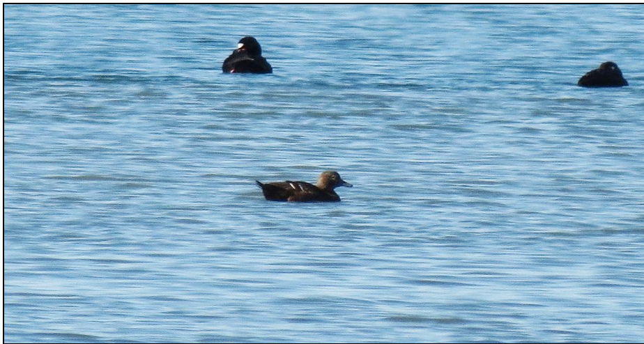
Figure 2. Female Steller's Eider with scoters at the mouth of the Good River, near Gustavus, 28 April 2014. Note the gray bill, dark brown plumage, square head with pale area around the eyes, and secondaries bordered by two white bars.

STELLER'S EIDER: A female Steller's Eider at the mouth of the Good River 28 April–9 May 2014 provided the first Gustavus record (NKD, BBP; Figure 2). The regular winter range of this species extends east along the Pacific coast to Kodiak Island and lower Cook Inlet (Gibson 1984); it is casual in Southeast Alaska, where there are around 15 records.