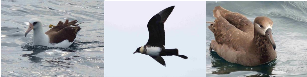
Figure 3. A trip to the Fairweather Grounds offered an excellent opportunity to photograph pelagic birds 25 May 2014, including a Laysan Albatross (left), Pomarine Jaeger (center), and Black-footed Albatross (right).

LEACH'S STORM-PETREL: A total of 1300 Leach's Storm-Petrels were tallied on offshore waters from west of Forrester Island south to the British Columbia border in a two-hour period 19 May 2014 (PEL, et al.).