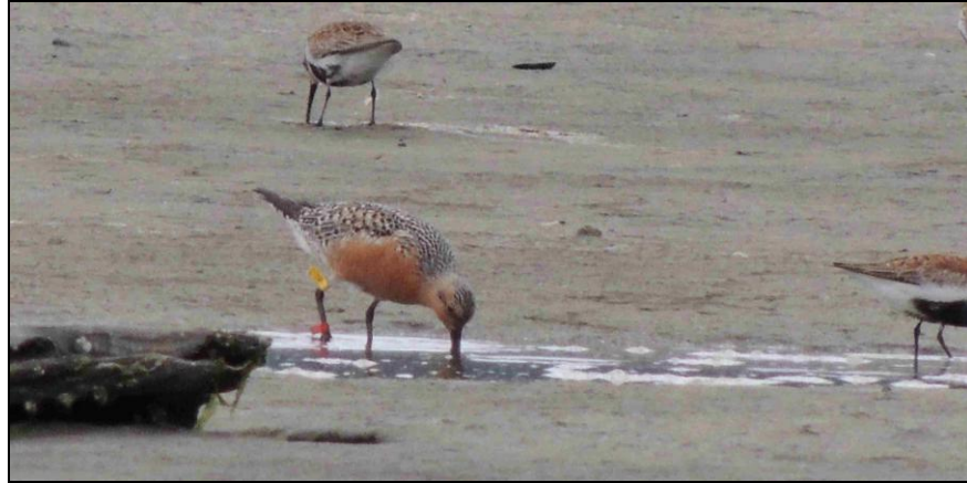
Figure 7. This Red Knot at Eagle Beach, near Juneau, 11 May 2014 had probably been banded at Guerrero Negro, Baja California Sur.

BONAPARTE'S GULL: A Bonaparte's Gull at Gustavus 3 April 2014 (NKD) provided a new local arrival date by about a week. Five at Ketchikan 23 March 2014 (AWP) was a typical arrival date for southern Southeast.