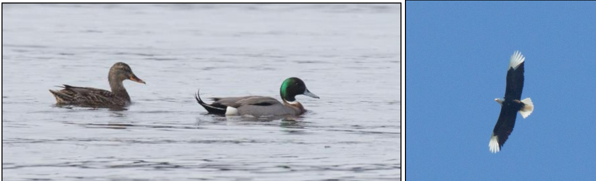
Figure 1. Oddities at Sitka this spring included a classic drake Mallard × Northern Pintail hybrid (left) 13 April 2014 and an adult Bald Eagle with symmetrically-patterned, pure white outer primaries photographed 1 May 2014. The eagle has been observed in the Sitka area since 2005 or 2006.

BLUE-WINGED TEAL: A drake Blue-winged Teal at Ketchikan 6 April 2014 (JHL) was extremely early. This duck is typically a May–early June migrant (Kessel and Gibson 1978); the earliest Alaska arrival date that we know of is 14 April 2003 ( North American Birds 57:389).