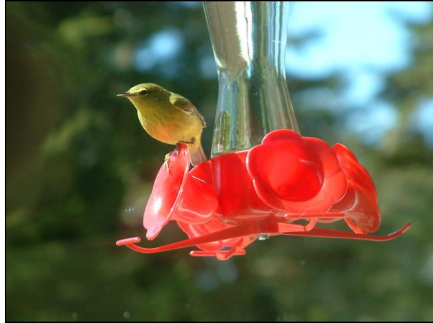
Figure 9. Orange-crowned Warblers regularly visit nectar-bearing flowers, such as blueberry, salmonberry, and ornamental red-flowering current (SCH, pers. obs.). This taste for nectar occasionally brings them to hummingbird feeders, like this bird at Juneau 1 May 2014.

WHITE-THROATED SPARROW: Wintering White-throated Sparrows were last noted at Sitka 16 April 2014 (MLW) and Auke Bay, near Juneau, 20 April 2014 (GBV). Singles were also noted at Ketchikan 3–21 March 2014 (SCH, AWP) and 29–30 April 2014 (AWP).